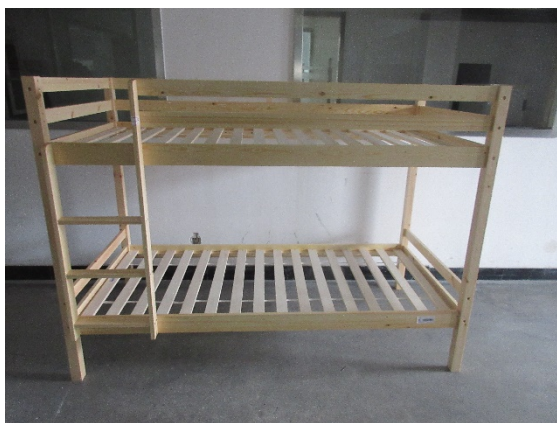
Sample as received - View 1