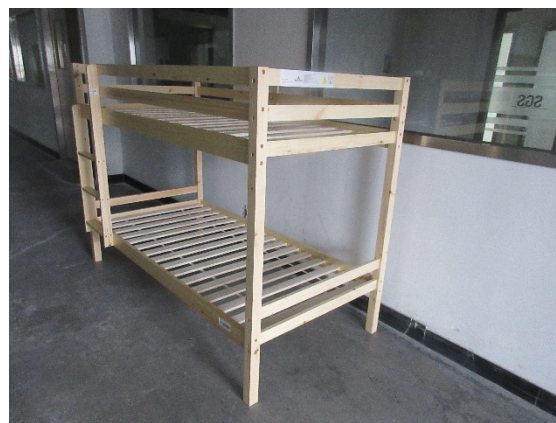
Sample as received - View 2